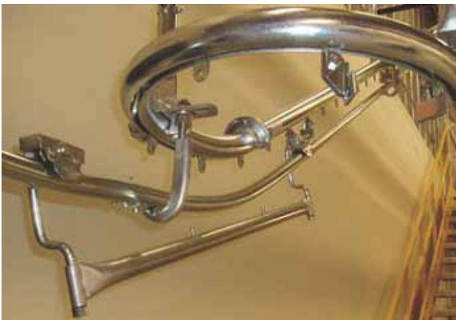
RK Trolley Booster conveyor