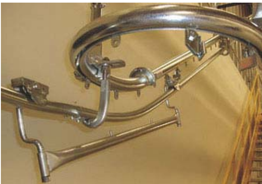
RK Trolley Booster conveyor